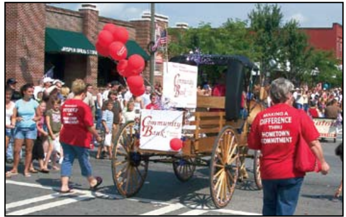
Community Bank's entry in recent 4th of July parade.

Any list usually falls short, but I hope you get the idea that we do want to make a difference and that we are committed to our hometown. When you bank with us, we don't want you to be reasonably happy or kinda sorta okay... We want you to feel good about your experience... and tell others about your hometown bank! ●●●