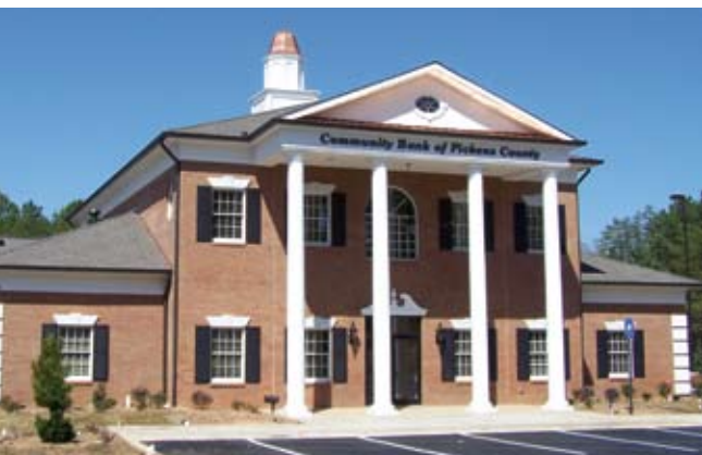
Cove Road location opening April 14, 2008

Community Bank of Pickens County "We can make a difference"