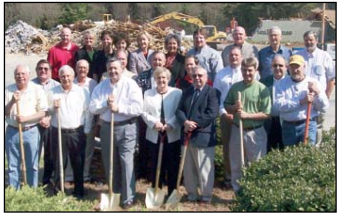
Official groundbreaking at our new location on Cove Road.